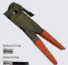
Before Crimp After Crimp