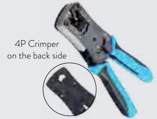
4P Crimper on the back side